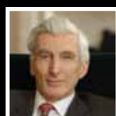
Lord Rees of Ludlow, OM, FRS

Chief Administrative Officer, Bill and Melinda Gates Foundation