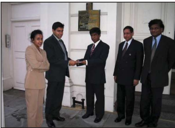
Making a donation for emergency relief to the Sri Lanka Disaster Relief Fund at the High Commission in London