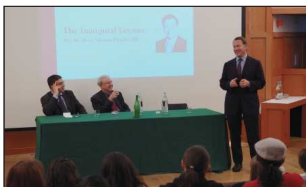
Michael Portillo delivered the inaugural lecture of the Speaker Series October 2004