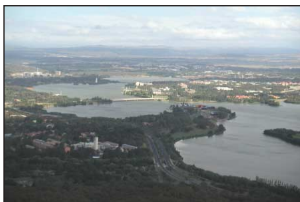
An aerial view of Canberra showing Lake Burley Griffin in the background

Canberra is also a very cultural and academic city. It is home to the National Gallery of Australia, and to the Australian National University, one of the country's premier universities. Ethnic cuisine in the city includes an amazing variety of Vietnamese, Thai, Indian, Malaysian, Greek, and Italian foods.