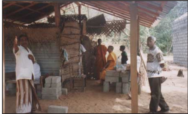
Reconstruction of a new school at grass-root level in Pothuwil, Sri Lanka using funds sent

Colleges, and members of the sympathetic general public in Cambridge helped raise more than £2500 in the initial phase. The majority of these donations have been directed to the Government approved Sri Lanka Disaster Relief Fund established at the Sri Lanka High Commission in London. Several donations have also been made to government-approved charities in Sri Lanka. These include a 100-houses rebuilding project launched by the Senkadagala United Tsunami Relief Fund and a school and library rebuilding project near Pothuwil in the South-Eastern corner of Sri Lanka. Children of all ethnic backgrounds will study there to signify the appreciation of national unity at times of devastation in Sri Lanka. If you would like to help with Dr. Pandula's ongoing efforts, contact him at: pma29@cam.ac.uk . The support of the fellow Gates scholars can go a long way to help those in need.