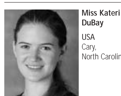
DuBay USA Cary, North Carolina

Time with friends, skiing, SCUBA diving, racquet sports, soccer (football), rollerblading, tutoring, travelling, music, fire spinning, theatre.