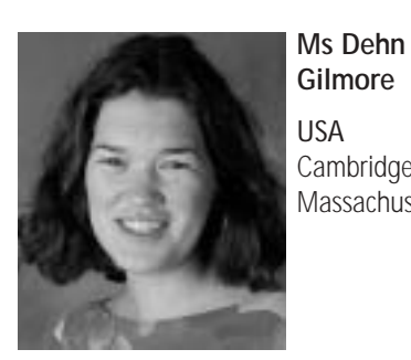
Gilmore USA Cambridge, Massachusetts

MPhil European Literature; Trinity College