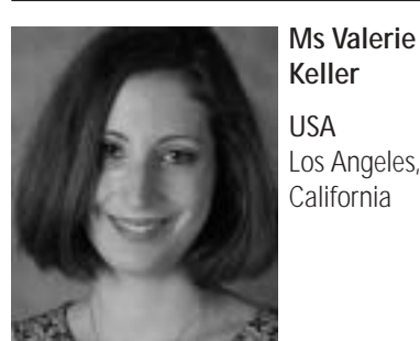
Keller USA Los Angeles, California

Hiking; Camping; Biking; Ultimate Frisbee; Volkswagon Beetle enthusiast.